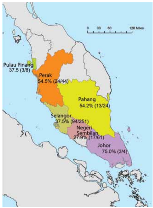
Figure. State of origin and prevalence of macacine herpesvirus 1 shedding within sampled groups of macaques (no. positive/total tested) from Peninsular Malaysia, September 2009–July 2011.