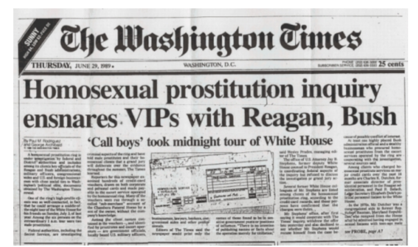
How quickly we forget!

The corporate controlled media was all too eager the Sandusky case until The Second Mile Foundation surfaced and the Gricar disappearance came to light.