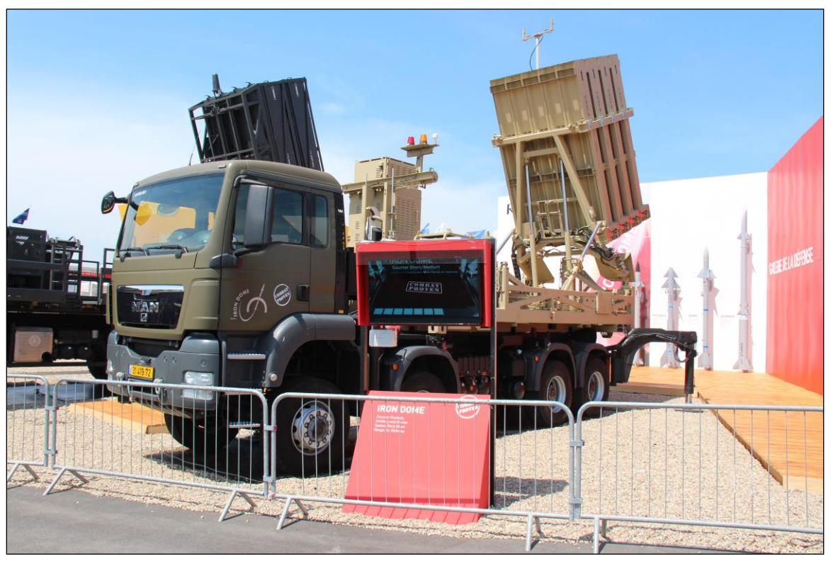
Figure 5. Iron Dome Launcher

In September 2016, an Iron Dome battery stationed in the Israeli-controlled Golan Heights intercepted two stray projectiles fired from Syrian territory, marking the first instance when Iron Dome was used to defend Israeli territory against threats emanating from the Syria conflict.