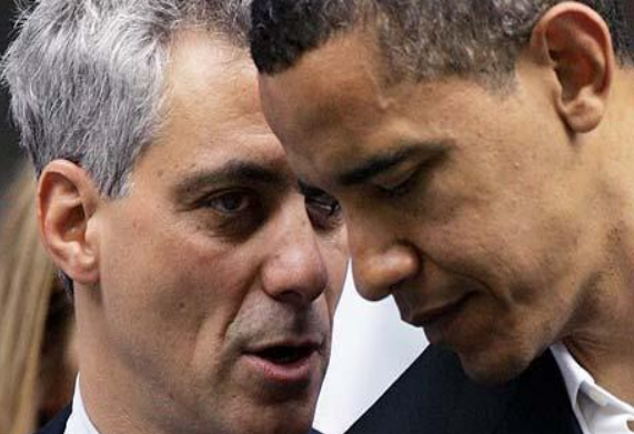
Man's Country, one of Chicago's "grand old bathhouses" and located at 5015 North Clark Street in Chicago's "Boystown," was a frequent hangout for State Senator Obama and Rahm Emanuel