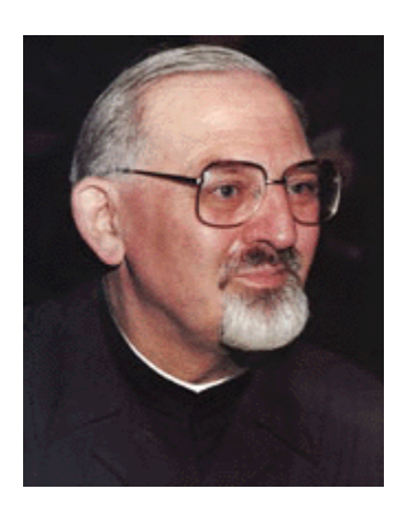
The "Black" Pope Count Hans Kolvenbach—The Jesuit's General