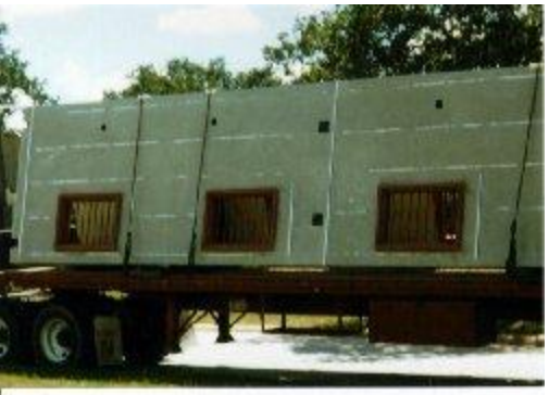
Temporary Jail Cells