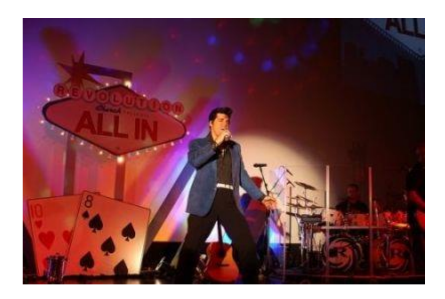
James 4:4: Ye adulterers and adulteresses, know ye not that the friendship of the world is enmity with God? whosoever therefore will be a friend of the world is the enemy of God.