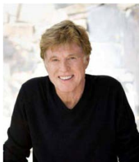
Robert Redford AKA (Bob) Actor; director; conservationist

Wildwood Enterprises 725 Arizona Avenue, Suite 306 Santa Monica, CA 90401