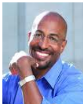
Van Jones Co-Founder and President, Rebuild the Dream