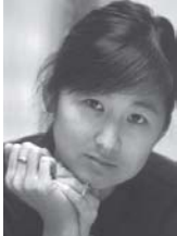
Maya Lin Artist/ Designer

Maya Lin Studio 112 Prince Street New York, NY 10012