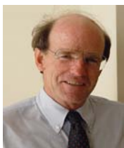
Laurance Rockefeller AKA (Larry) Conservationist