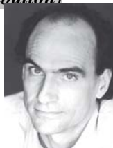
James Taylor Singer/ Songwriter

NRDC Committees: Finance; Investment, Chair; Program