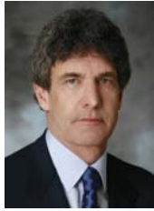
Alan F. Horn, Vice Chair Chairman, The Walt Disney Studios

The Walt Disney Studios 500 S. Buena Vista Street Team Disney #604 Burbank, CA 91521-0994