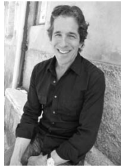
Peter A. Morton Chairman/Founder, 510 Development Corp.

510 North Robertson Boulevard Los Angeles, CA 90048