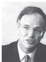
James Gustave Speth AKA (Gus) Professor of Law, Vermont Law School; Distinguished Senior Fellow, Demos

NRDC Committees: Communications, Co-Chair; Institutional Strategies