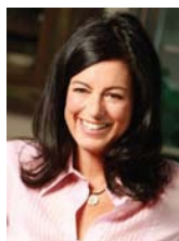
Laurie David Producer; activist; author

NRDC Committees: Communications; Development