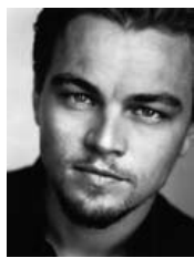
Leonardo DiCaprio Actor; environmentalist; Founder, Leonardo DiCaprio Foundation

NRDC Committees: Communications; Program